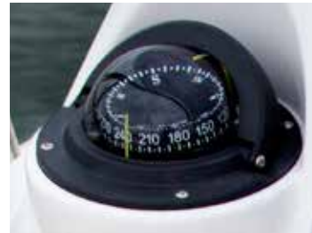
Black Compass F-83