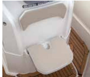
Console front seat