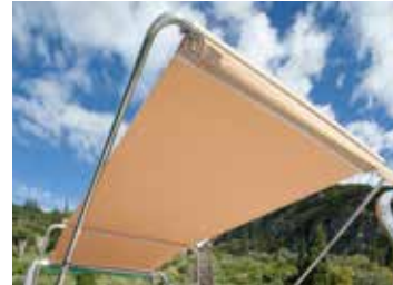
Bimini for roll Bar - beige (685 model)