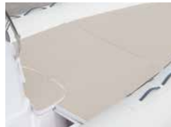
Bow extension sundeck with beige or white cushions (580/630 models)