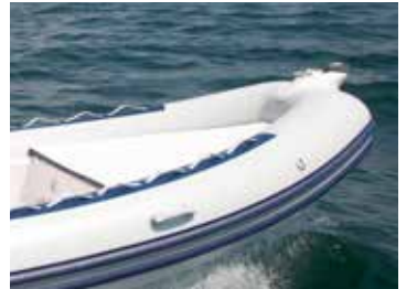
Bow sundeck cushion (Comfort models)