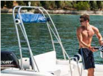
Stainless steel roll bar with navigation lights (except 685 models)