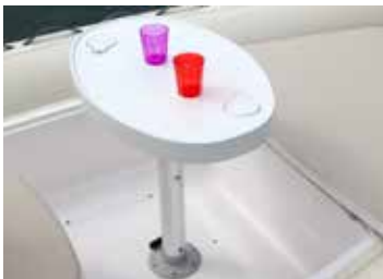
Bow kit table with support