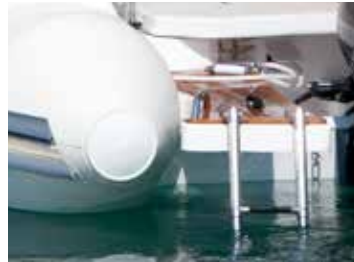
Deck shower with water tank: 39 liter (500/500) or 45 liter (580/630/685)