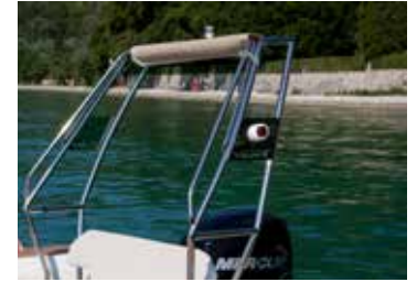
Stainless steel roll bar with navigation lights (685 model)