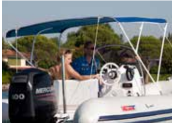
Bimini in painted aluminium - blue or beige