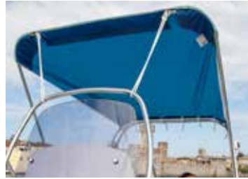
Bimini for Roll Bar - blue or beige