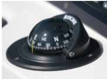
Black Compass F-50