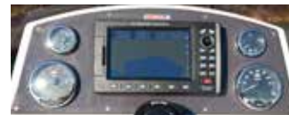
SmartCraft for 630 models