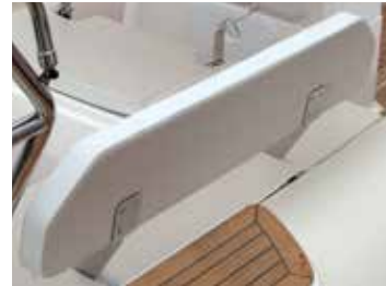
Fixed right side backrest with cushions