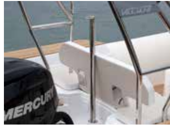
Stainless steel ski mast