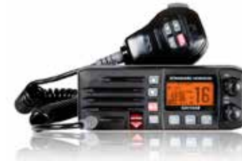
VHF model Standard Horizon GX 1100 + Antenna Bantén Fastif + bracket