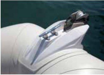
Fibreglass bow roller